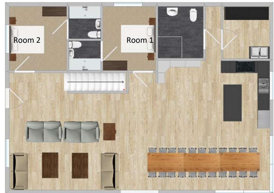
Downstairs NOT TO SCALE