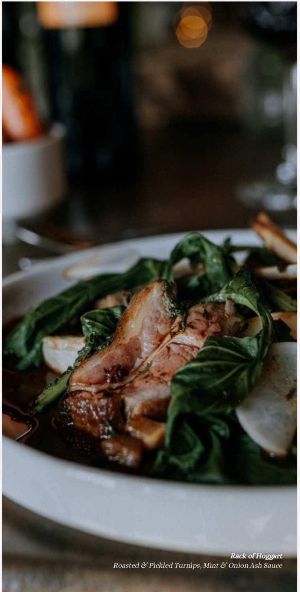
Rack of Hoggart Roasted & Pickled Turnips, Mint & Onion Ash Sauce