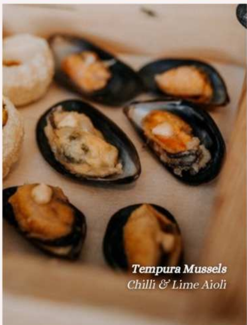
Tempura Mussels Chilli & Lime Aioli