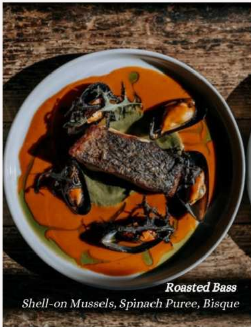
Roasted Bass Shell-on Mussels, Spinach Puree, Bisque