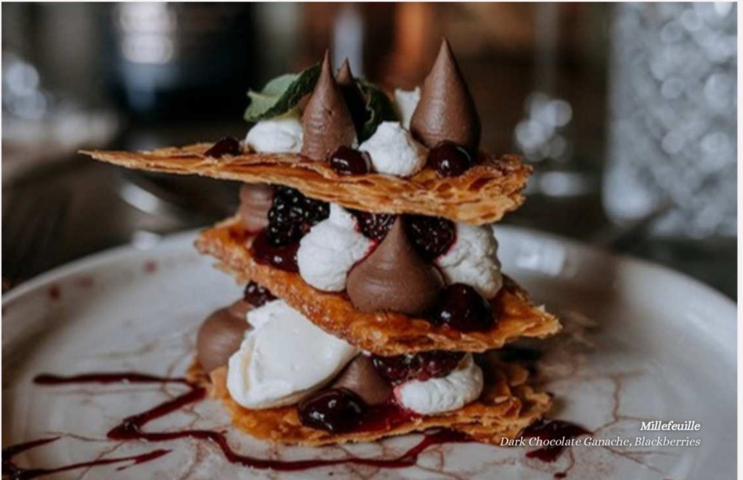
Millefeuille Dark Chocolate Ganache, Blackberries