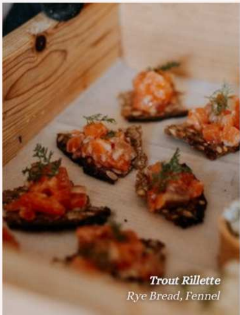
Trout Rilette Rye Bread, Fennel