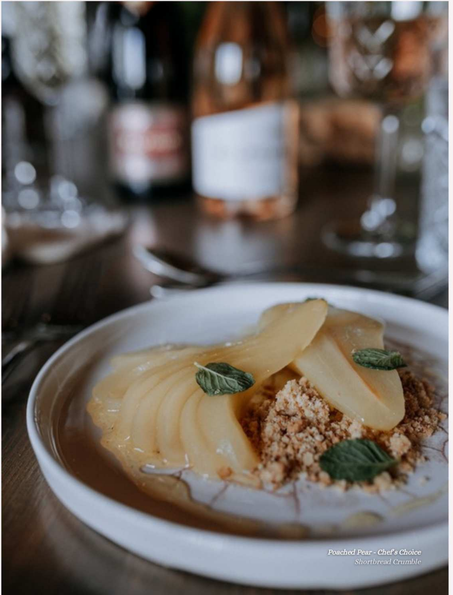
Poached Pear - Chef's Choice Shortbread Crumble