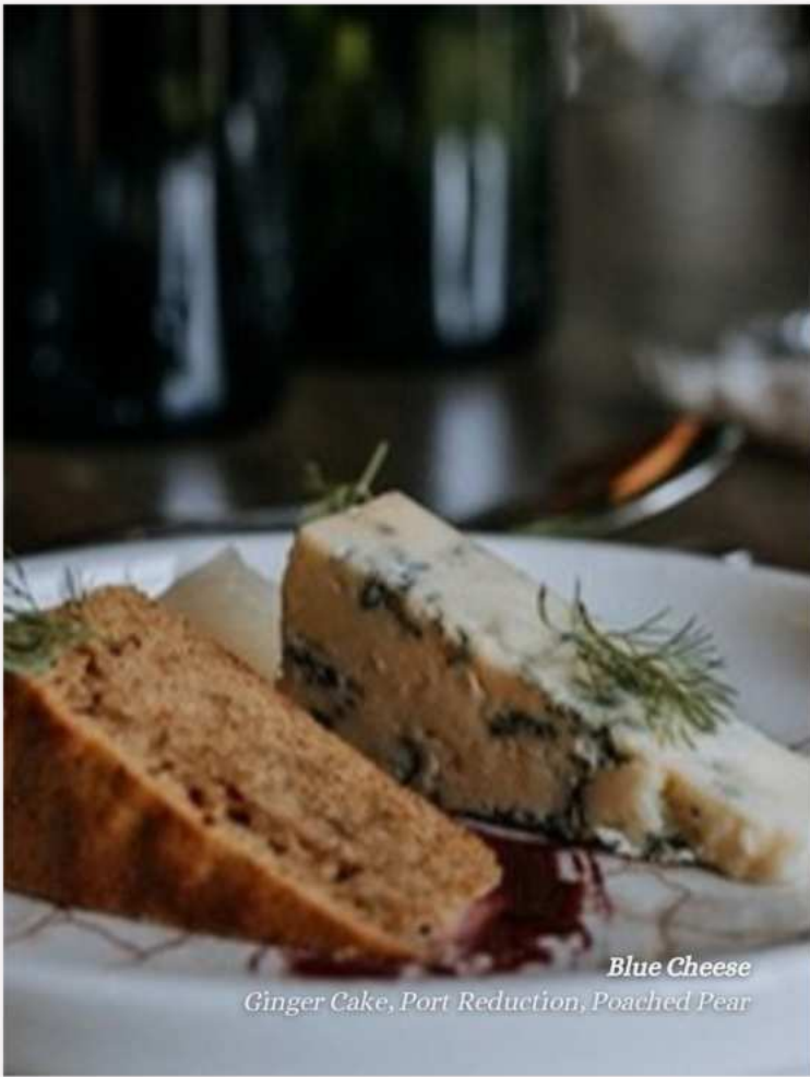
Blue Cheese Ginger Cake, Port Reduction, Poached Pear