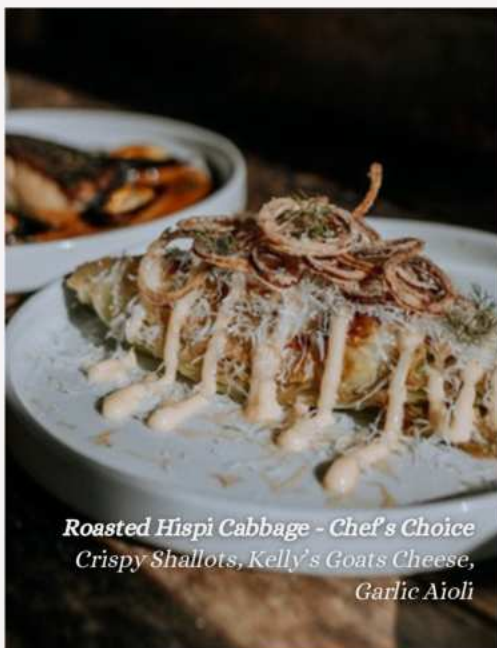
Roasted Hispi Cabbage - Chef's Choice Crispy Shallots, Kelly's Goats Cheese, Garlic Aioli