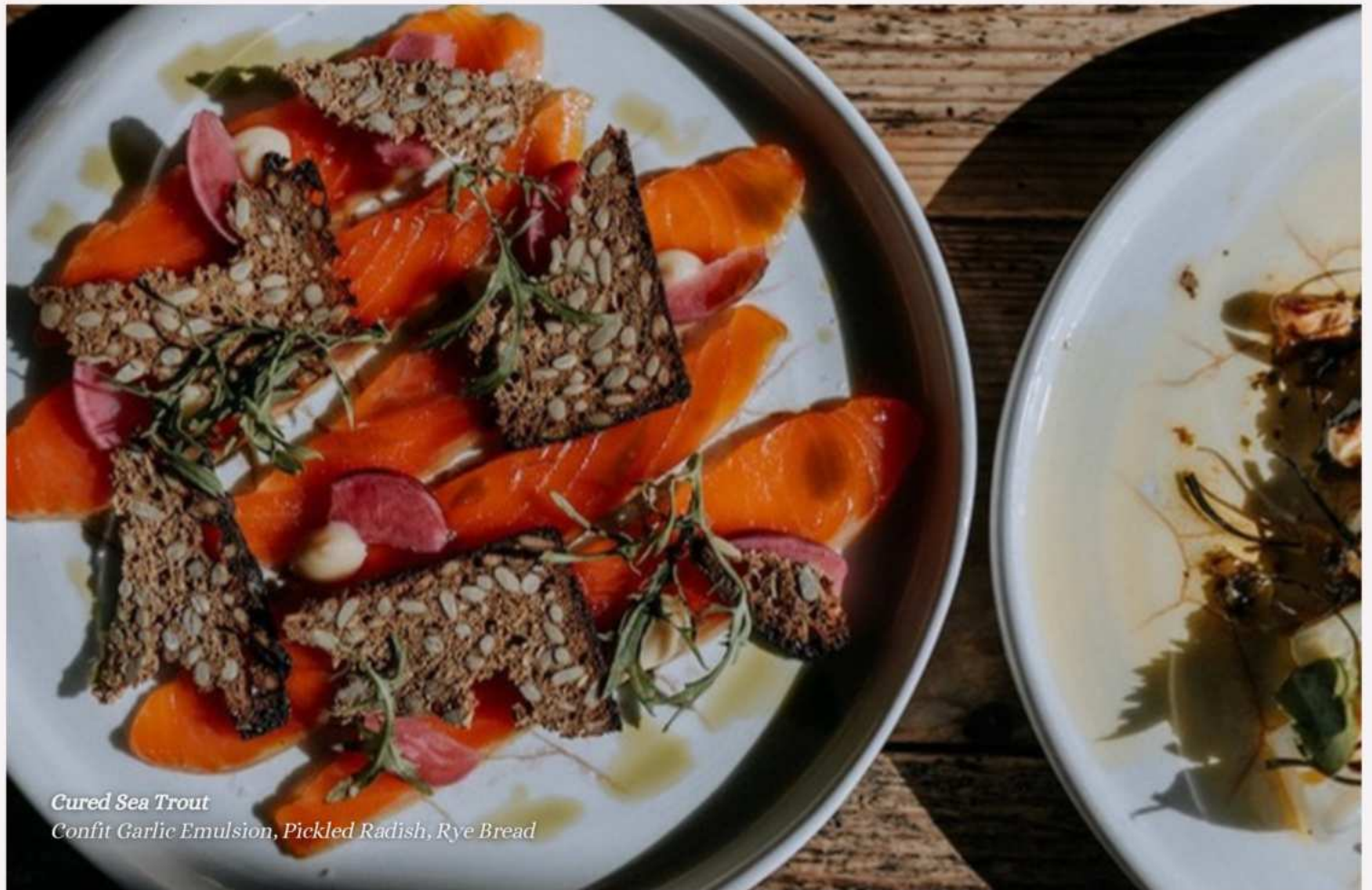
Cured Sea Trout Confit Garlic Emulsion, Pickled Radish, Rye Bread