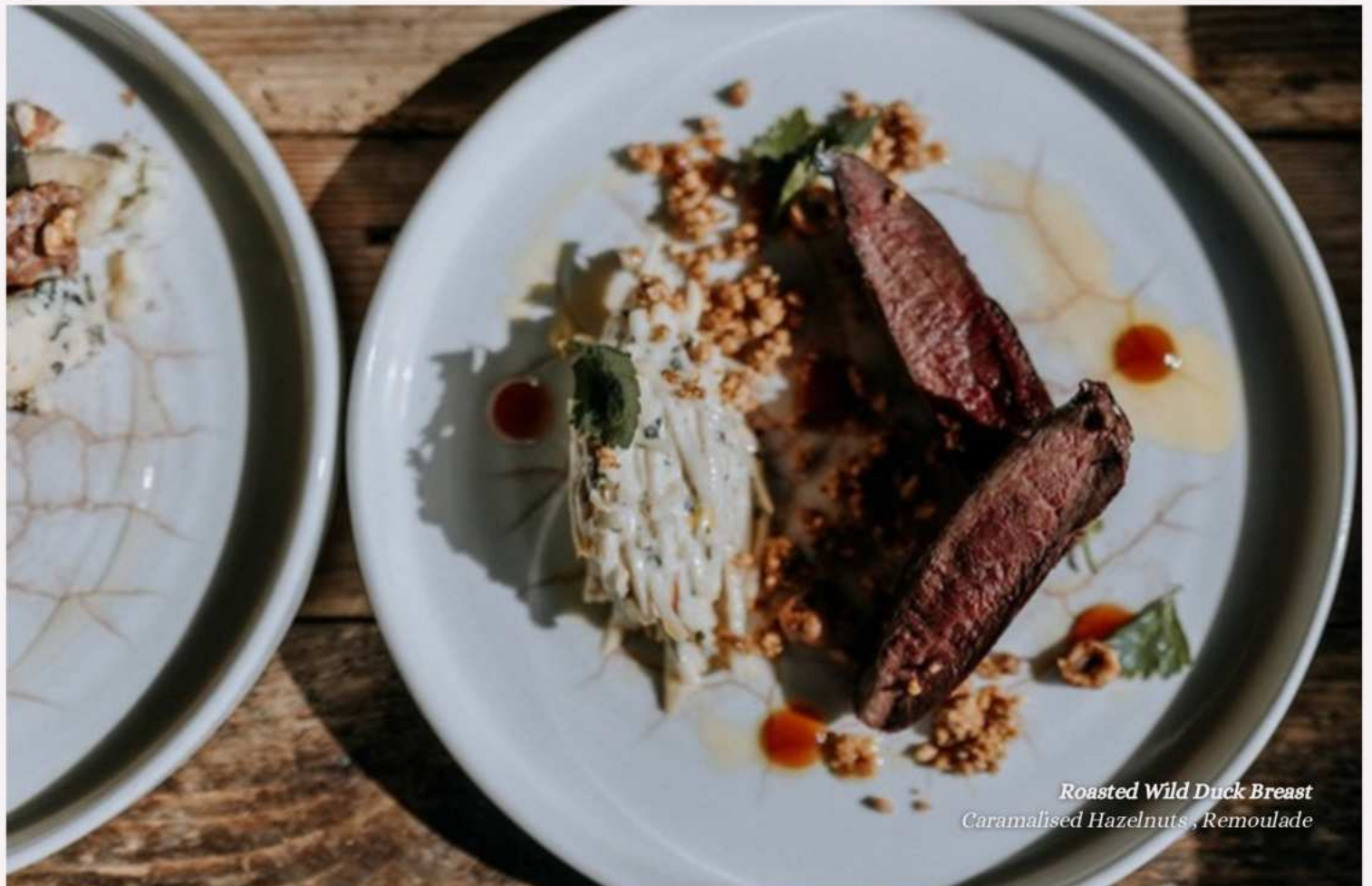
Roasted Wild Duck Breast Caramelised Hazelnuts, Remoulade