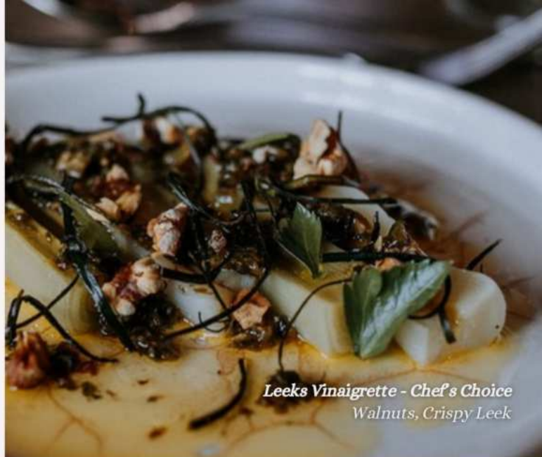
Leeks Vinaigrette - Chef's Choice Walnuts, Crispy Leek

CHOOSE 3 FROM THE STARTER MENU, INCLUDING 1 VEGETARIAN OPTION