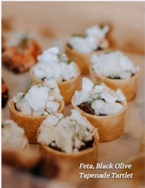
Feta, Black Olive Tapenade Tartlet