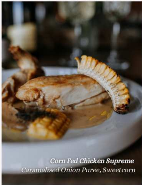
Corn Fed Chicken Supreme Caramalised Onion Puree, Sweet corn