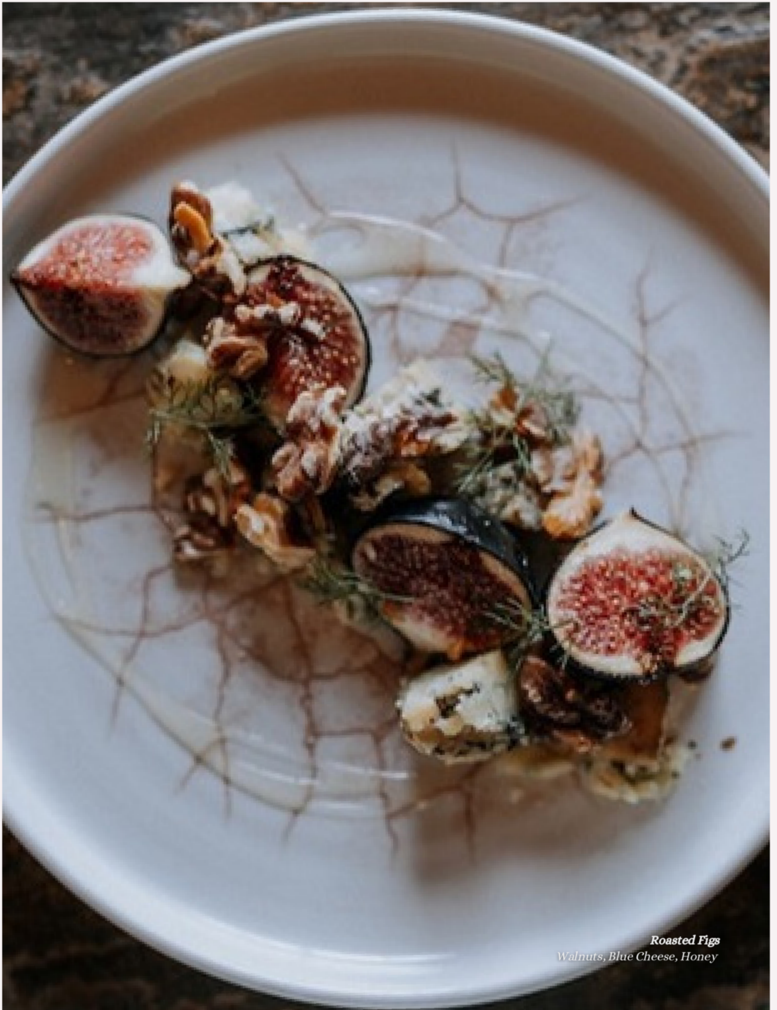
Roasted Figs Walnuts, Blue Cheese, Honey