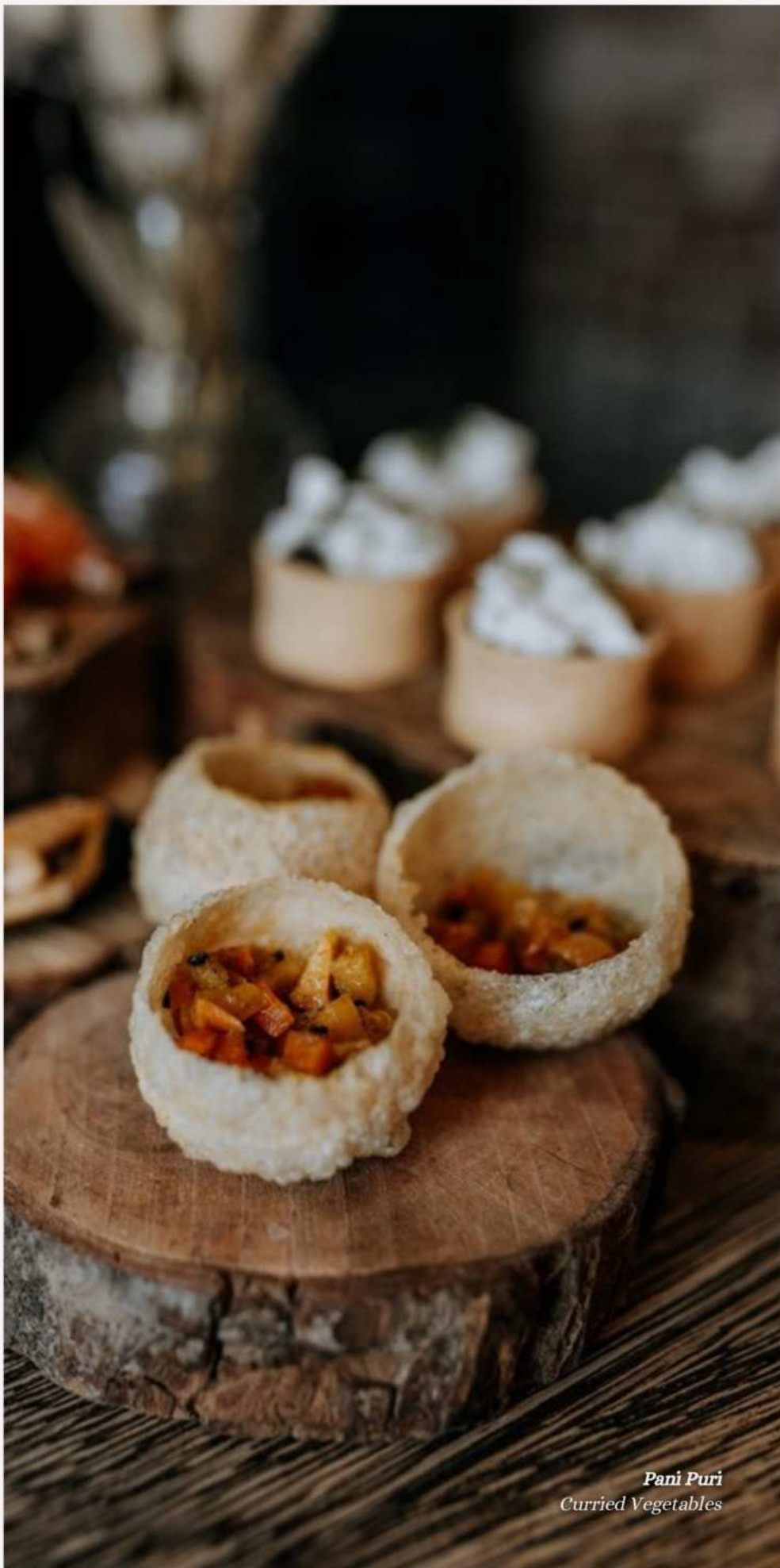
Pani Puri Curried Vegetables