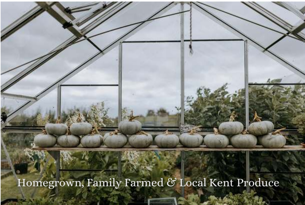
Homegrown, Family Farmed & Local Kent Produce

Our ethos also extends to the bar, where you can try a wealth of Kitchen Garden inspired cocktails and mocktails, Kent beers, wines and soft drinks, not to mention a selection of Copper Rivet spirits made using our family-farm grains.