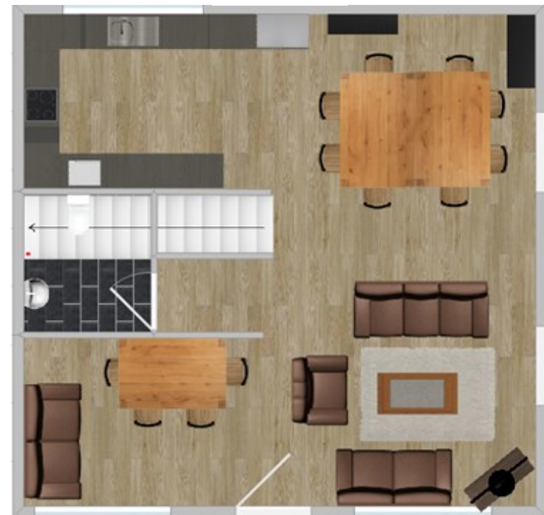
Downstairs NOT TO SCALE